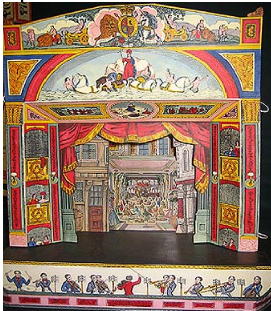
In the Victorian Era, the best theater houses produced posters showing architectural elements of the playhouse. Also on the poster sheets were aspects of the set and costume designs of a show from the