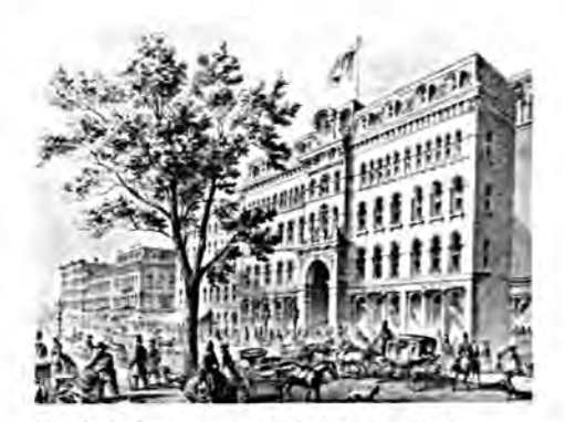
Crosby's Opera House, 1867. Lithograph.