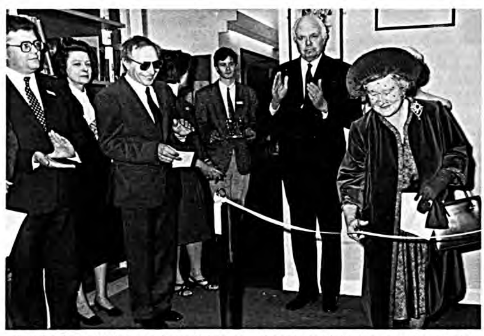
H.M. The Queen Mother cuts the symbolic tape at the opening of the BTA on February 17, 1987

The new premises, whose headlease is owned by Rockford College, Illinois, will allow the British Theatre Association to continue to provide and expand its many services. These include reference facilities, hiring sets of plays to theatre companies around the world, answering questions regarding copyright and history of a play's performance, locating authors'