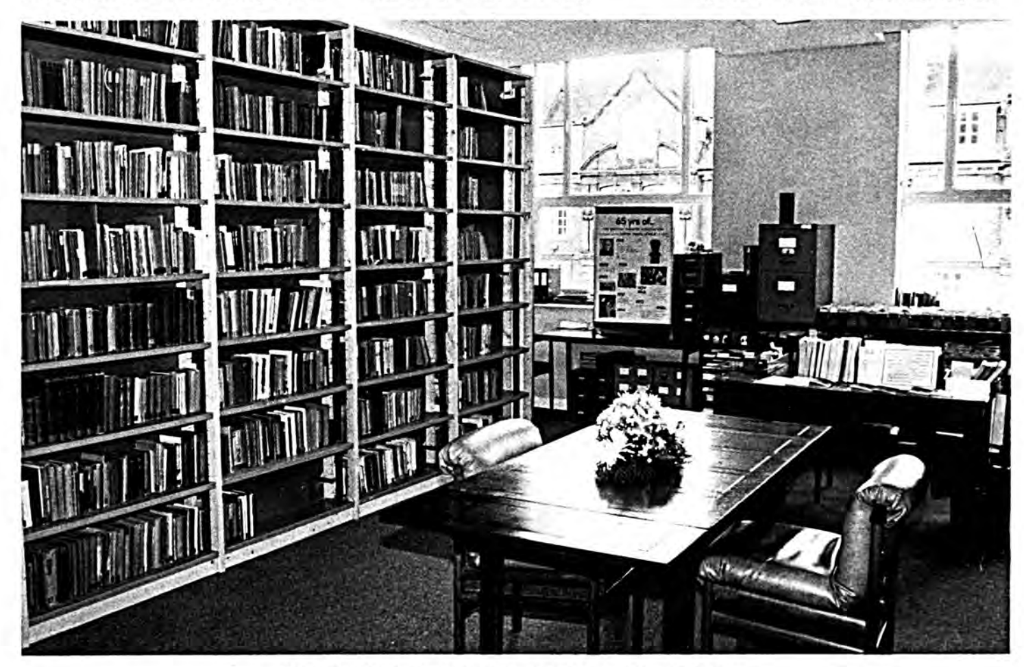
The British Theatre Association's new Play Library in Regent's College

The move to Regent's College heralds a new beginning which will involve computerization and the expansion of activities, including exhibitions and programs. The new address will be British Theatre Association, Regent's College, Inner Circle, Regent's Park, London NW1 4NS, England.