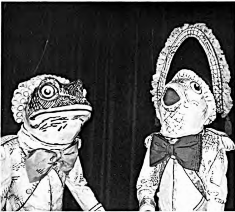
Frog and Fish Footmen, Alice in Wonderland , Broadway & PBS, 1983