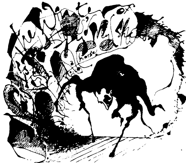
Antony Sher's sketch of himself as Richard III, from Year of the King , published in New York by Limelight Editions and in London by Methuen