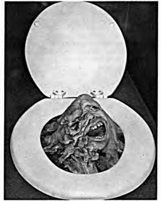
Melting Head, Street Trash (Film)