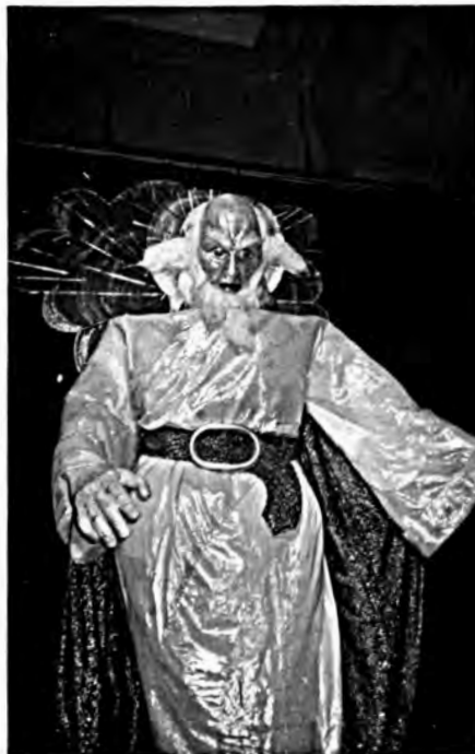
God Puppet, Taverner , Opera Company of Boston, 1985

The Association of Theatrical Artists and Craftspeople (ATAC) is the first and only trade association representing craftspeople working in the production fields of entertainment and performance. ATAC's members create an astonishing variety of works, including special effects, specialty costumes, models, masks and armor. Many of these objects were recently on exhibition in the Main Gallery at the Library and Museum of the Performing Arts at Lincoln Center.