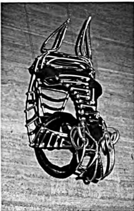
Horse Mask, Equus