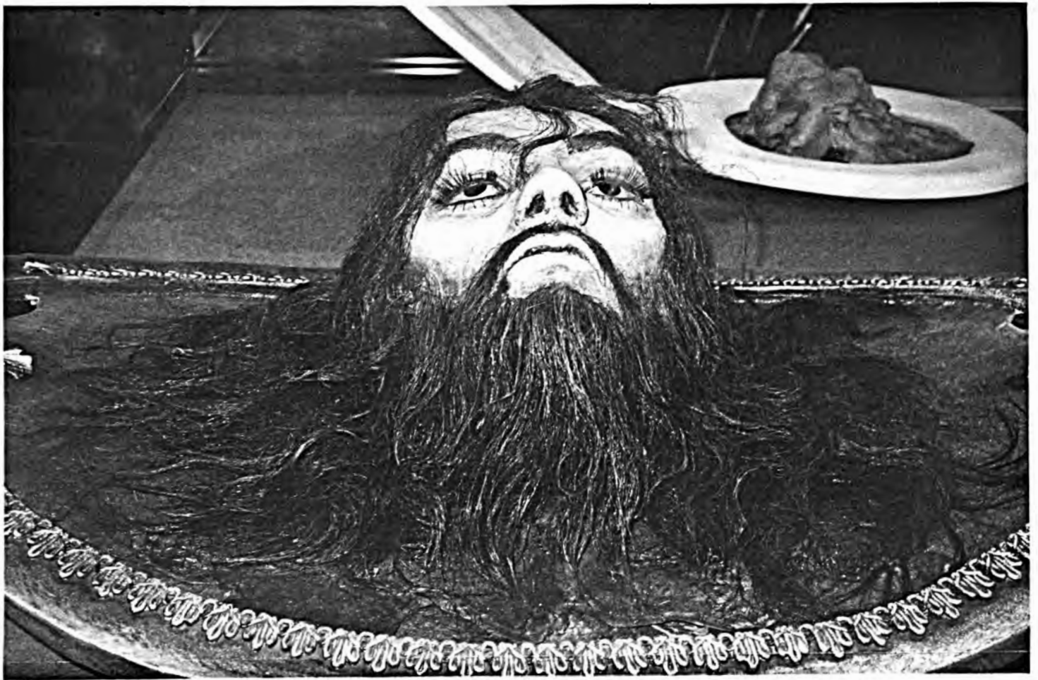
John the Baptist Decapitated Head, Salome , Hartford Grand Opera