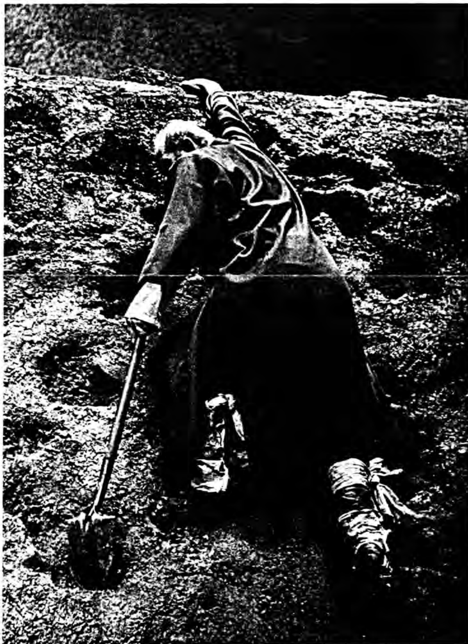
Harry Andrews in the title role in Lear , by Edward Bond (Royal Court Theatre, 1971)