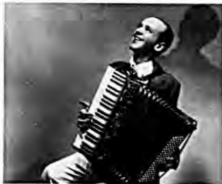
Fred Astaire ( The Band Wagon , 1931)