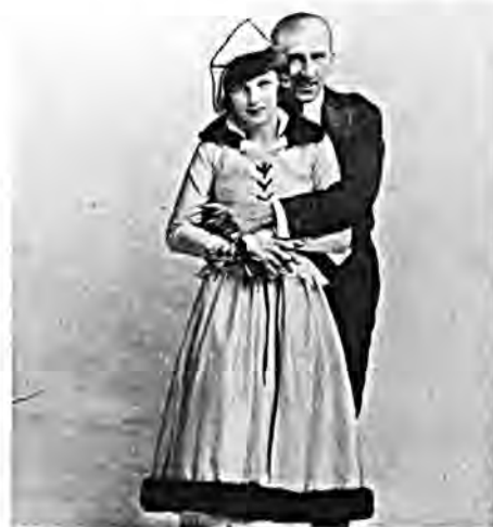
Vernon and Irene Castle ( Watch Your Step , 1914)