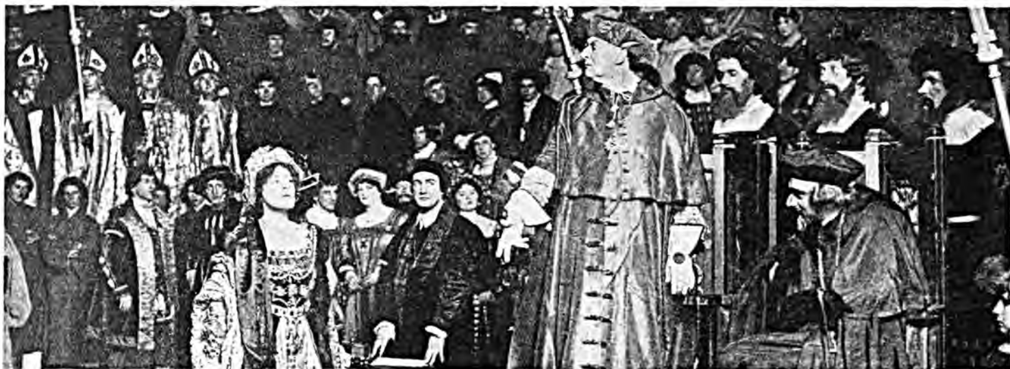
Elsie Ferguson (left), Herbert Beerbohm Tree (center) ( King Henry VIII , 1916)