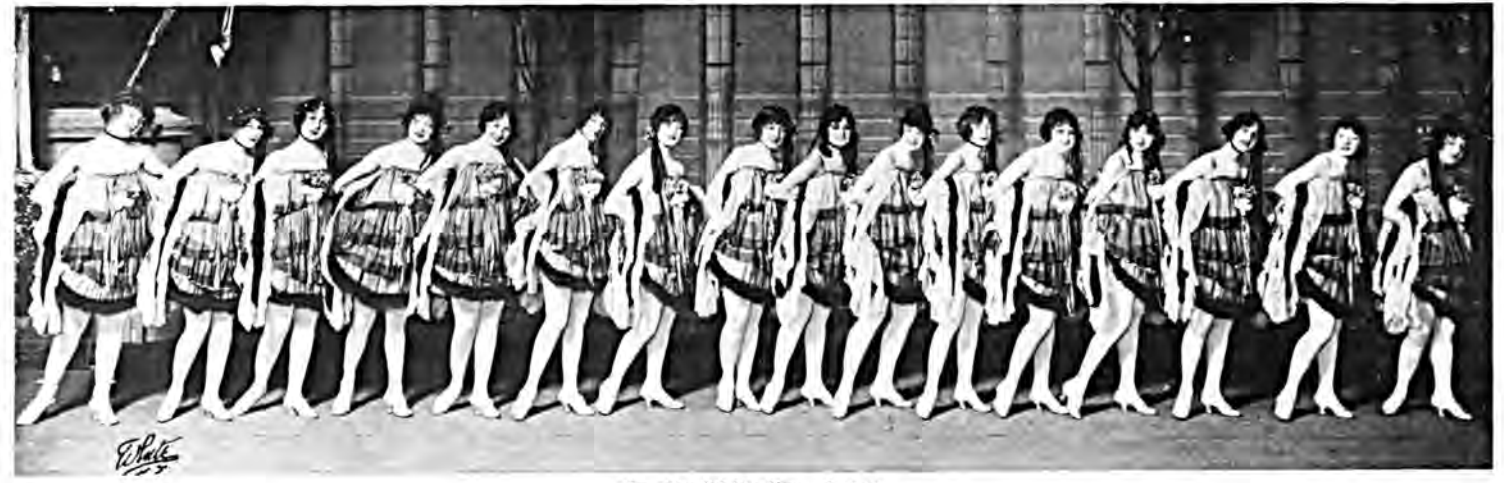
The Ziegfeld Follies of 1913

New York's New Amsterdam Theatre, which flourished from 1903 to 1937, was the subject of a recent exhibition at the Library and Museum of the Performing Arts at Lincoln Center. Curated by Alan Pally, the exhibition focused on the architecture of the building as well as the many extraordinary productions which played there. On view were programs, photographs, sheet music, memorabilia, and original costume and set designs from some of the most important theatrical events of the twentieth century.