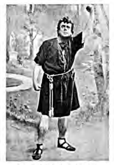
Nat C. Goodwin as Bottom (A Midsummer Night's Dream, 1903)